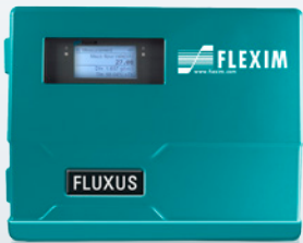
FLUXUS® G721 ST