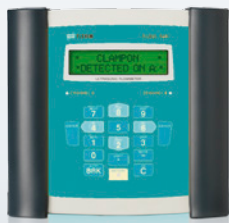
FLUXUS® G601 ST