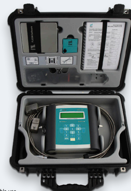
The FLUXUS® ST series is available for fixed installation and for portable use.